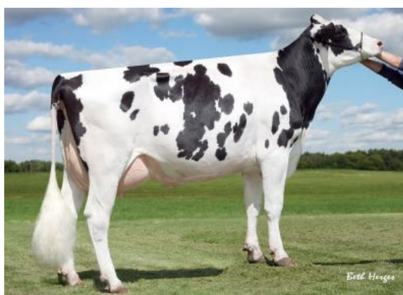
MGGD: Sully Shottle May-TW

MGS: Bacon-Hill Montross-ET MGD: De-Su 410-ET VG-85 02-04 3x 365d 30620m 3.7 1148f 3.2 982p MGGs: De-Su Observer-ET TR TV TL TY TD VG-86 MGGD: Sully Shottle May-TW EX-91 DOM 06-07 3x 365d 39960m 3.9 1555f 3.3 1302p