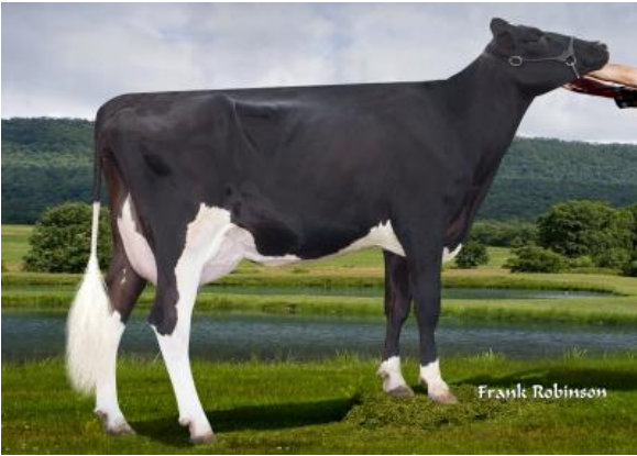
Dam: Ihg Power Elsa 9589-ET

Sire: Mr Rubi-Agronaut 73287-ET TL TV TD Dam: Ihg Power Elsa 9589-ET 03-04 2x 365d 40860m 2.7 1101f 3.3 1328p MGS: View-Home Powerball-P-ET MGD: Farnear Supersire 1678 03-01 2x 305d 23450m 4.0 930f 3.0 697p MGGS: Seagull-Bay Supersire-ET TV TL TY TD MGGD: Morningview Super Ellie-ET EX-91 04-00 3x 305d 32030m 3.2 1037f 2.8 907p